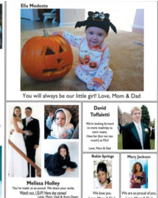
Half page ad